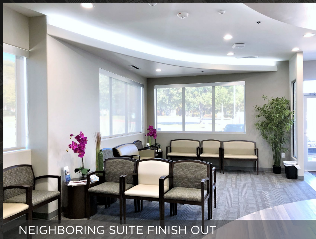
NEIGHBORING SUITE FINISH OUT